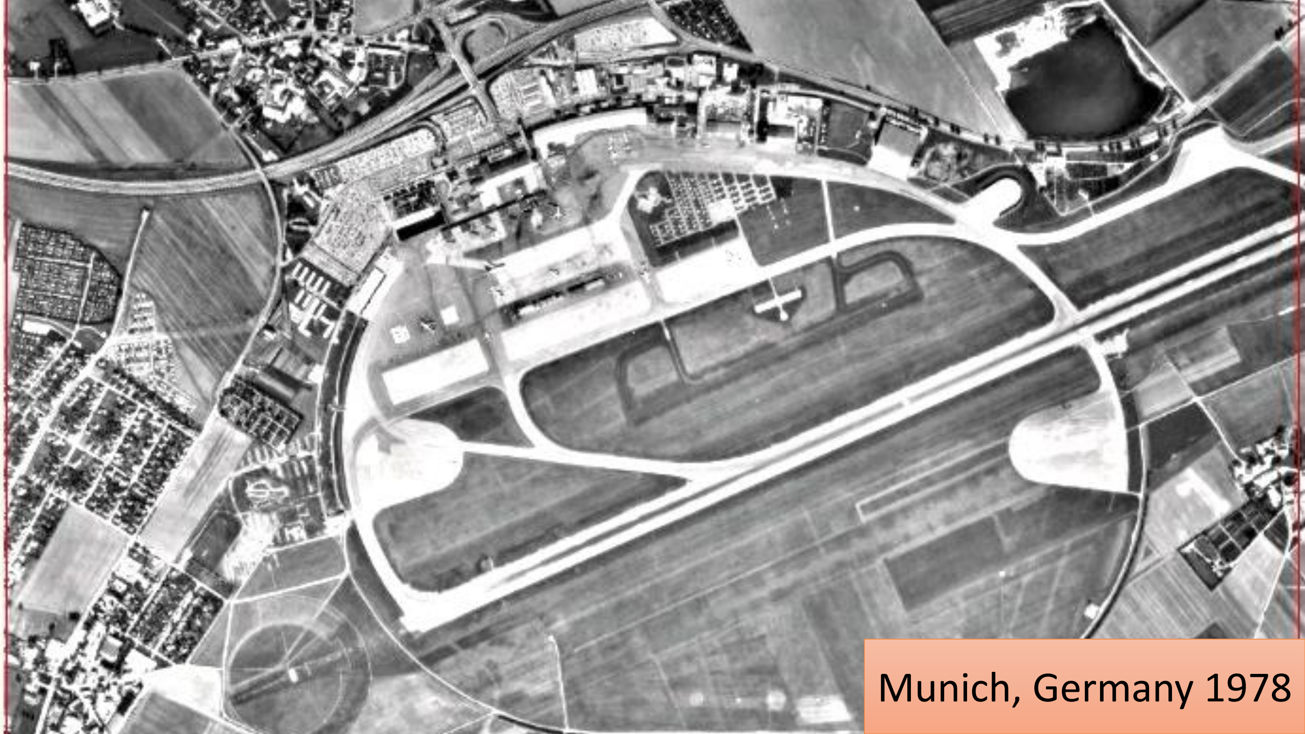
Munich, Germany 1978