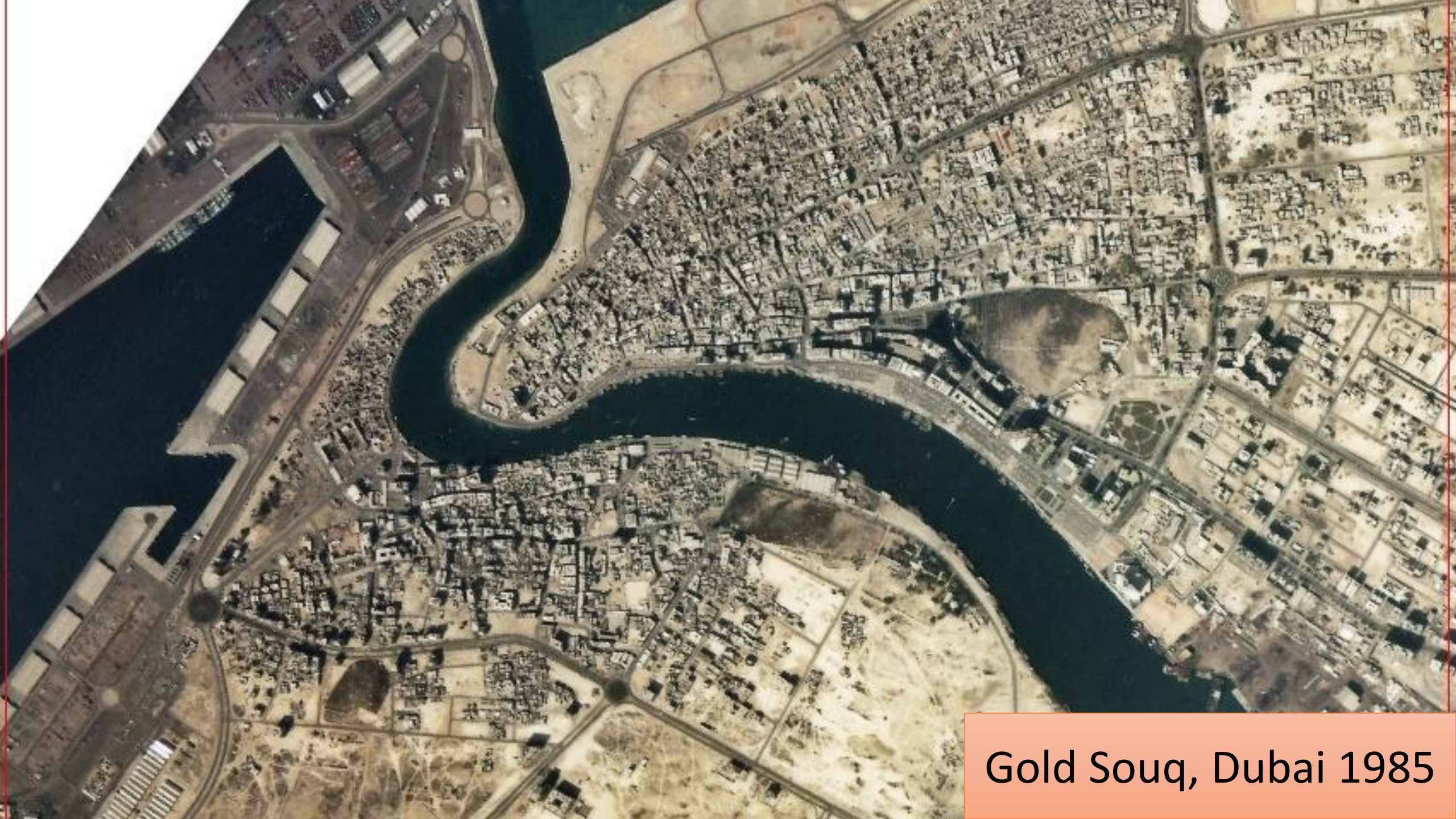
Gold Souq, Dubai 1985