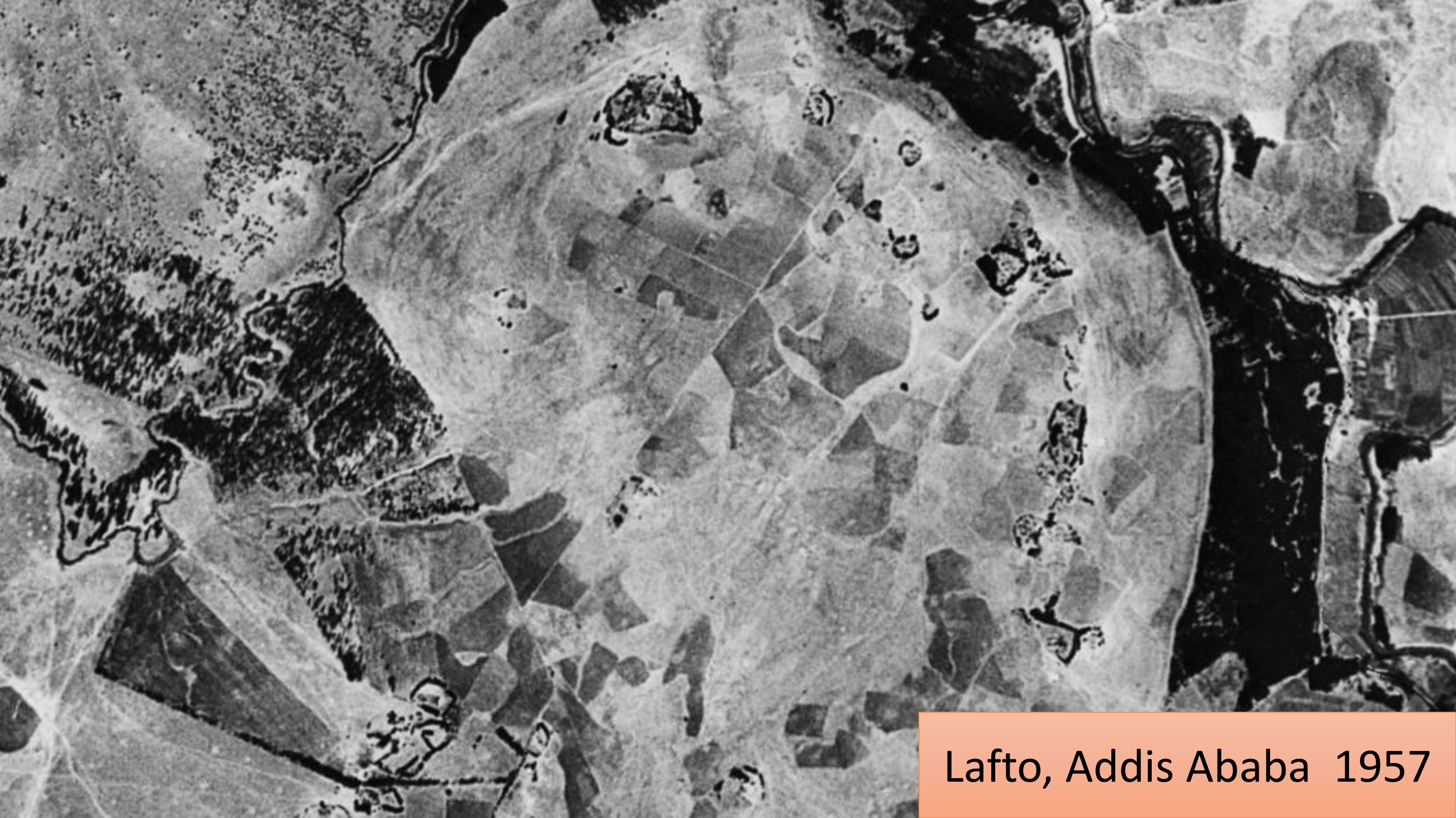
Lafto, Addis Ababa 1957