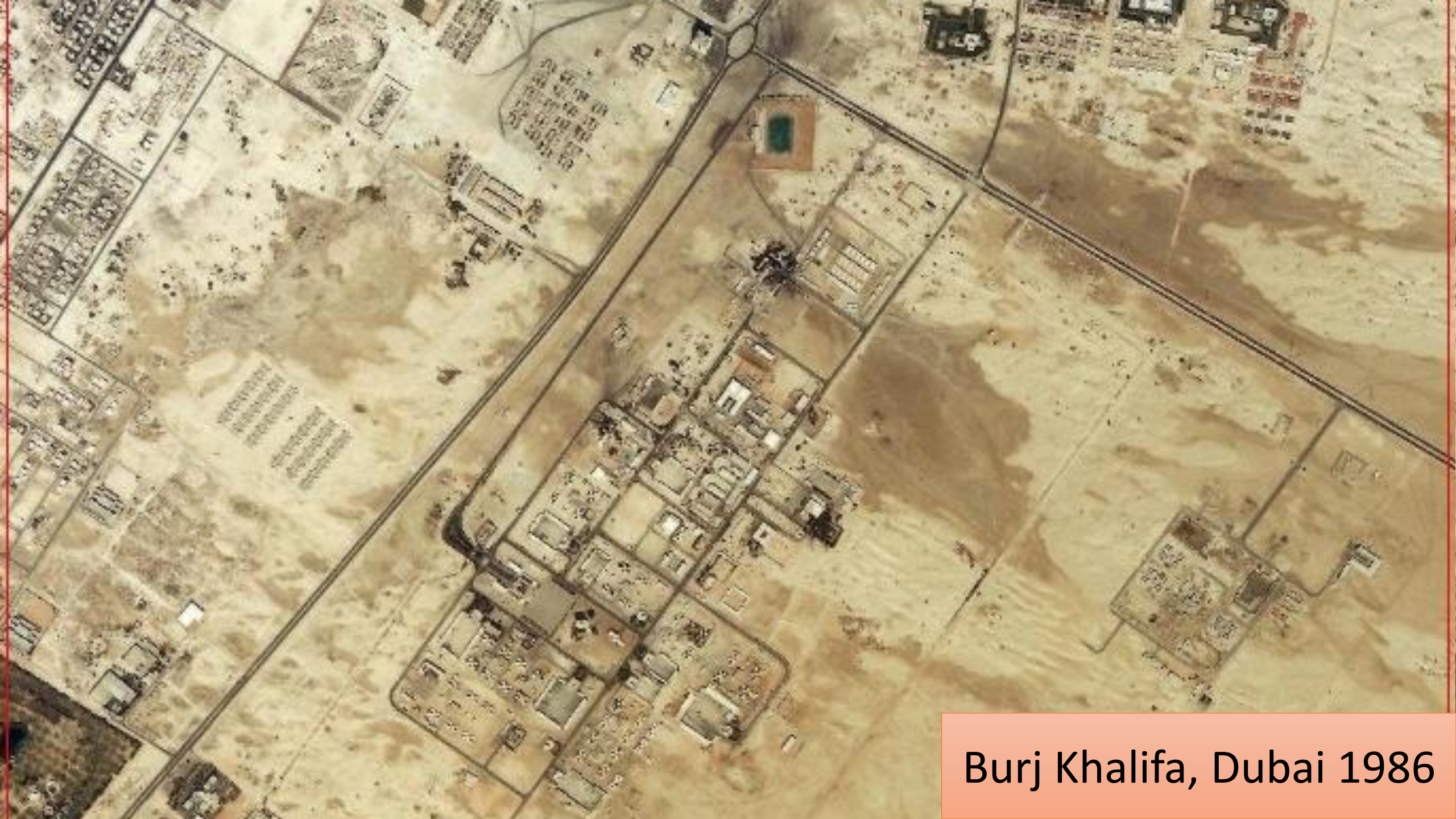
Burj Khalifa, Dubai 1986