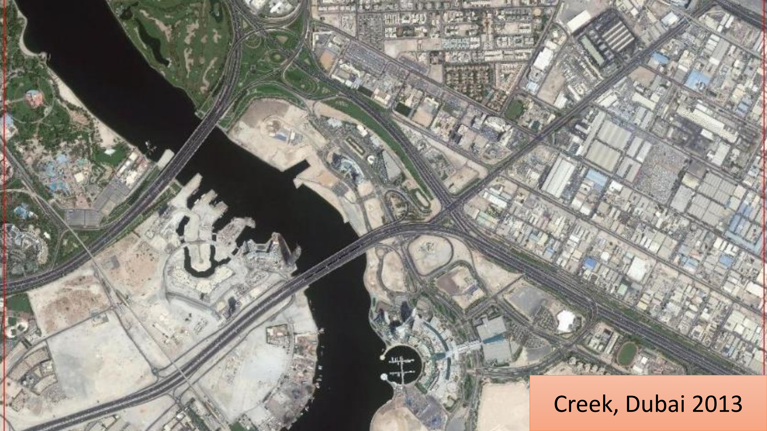
Creek, Dubai 2013