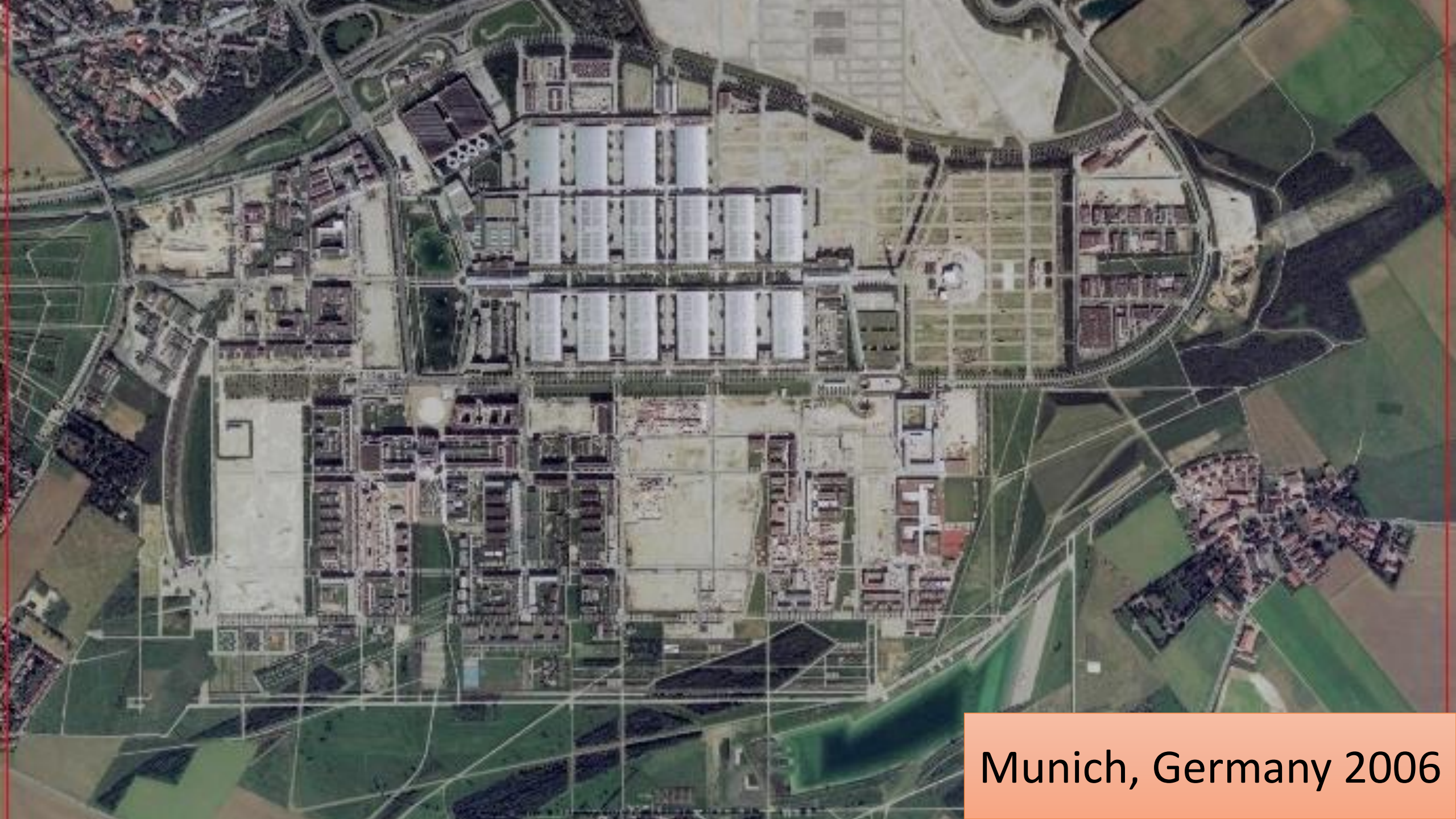
Munich, Germany 2006