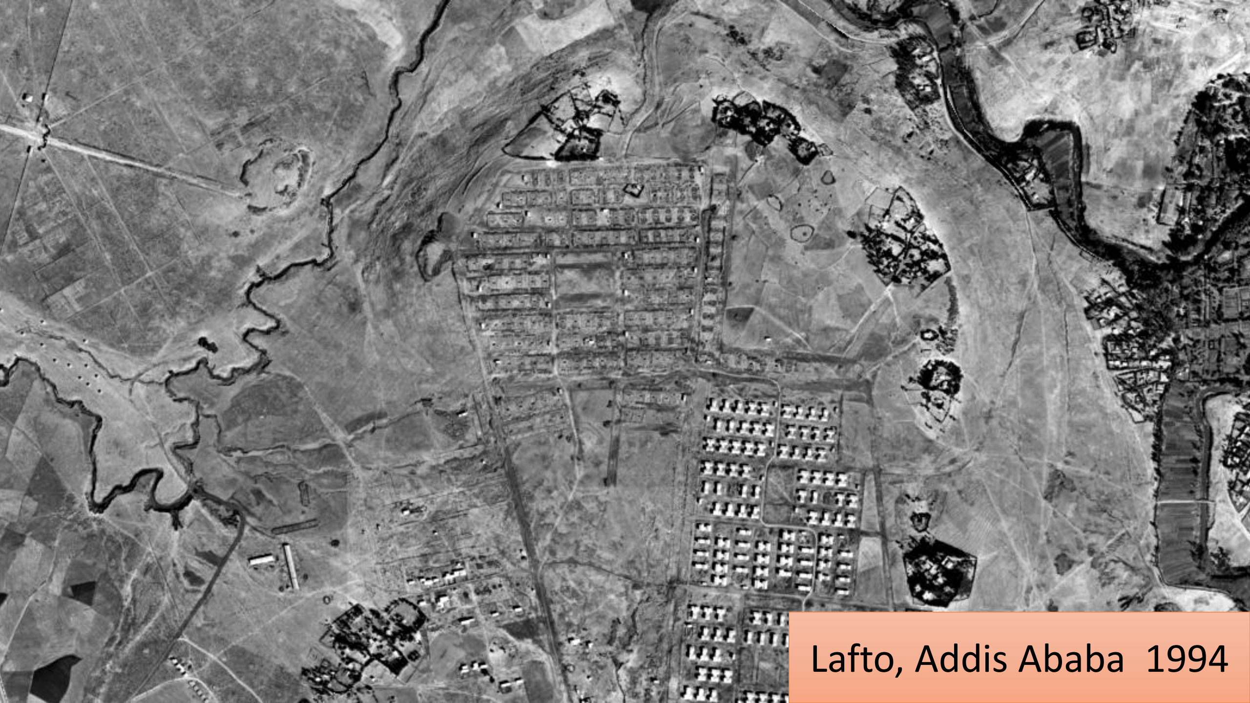
Lafto, Addis Ababa 1994