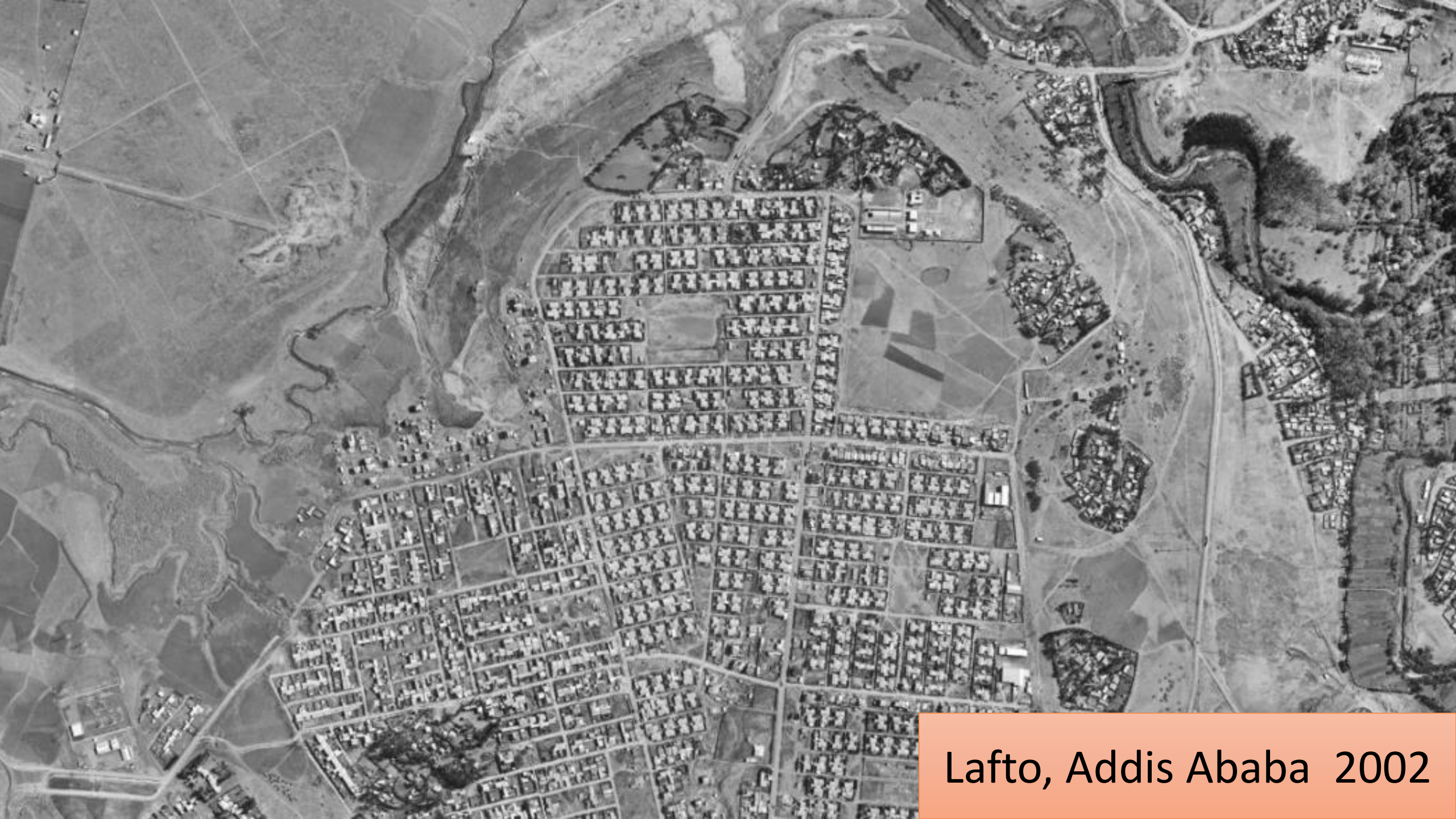
Lafto, Addis Ababa 2002