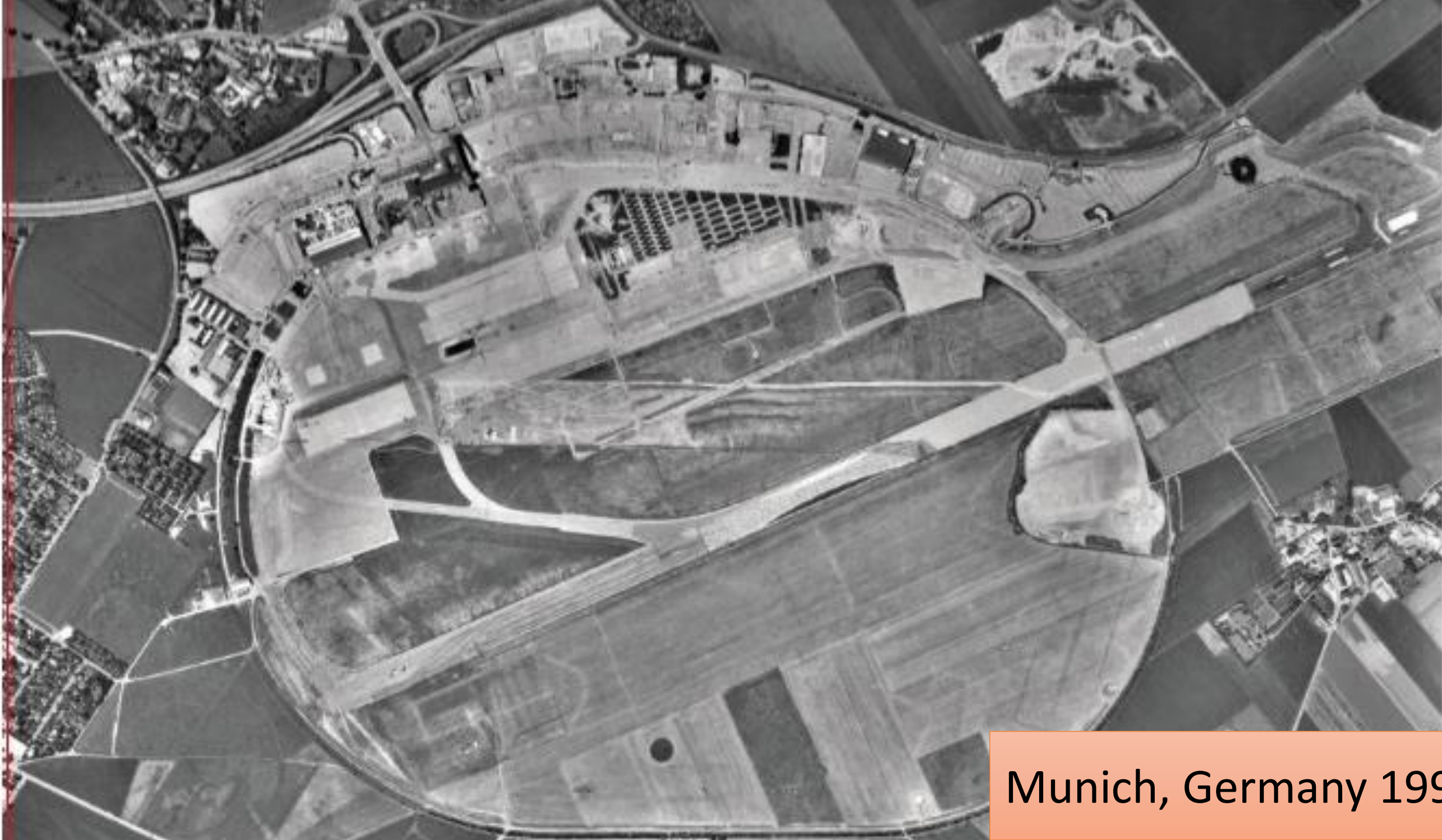
Munich, Germany 1994