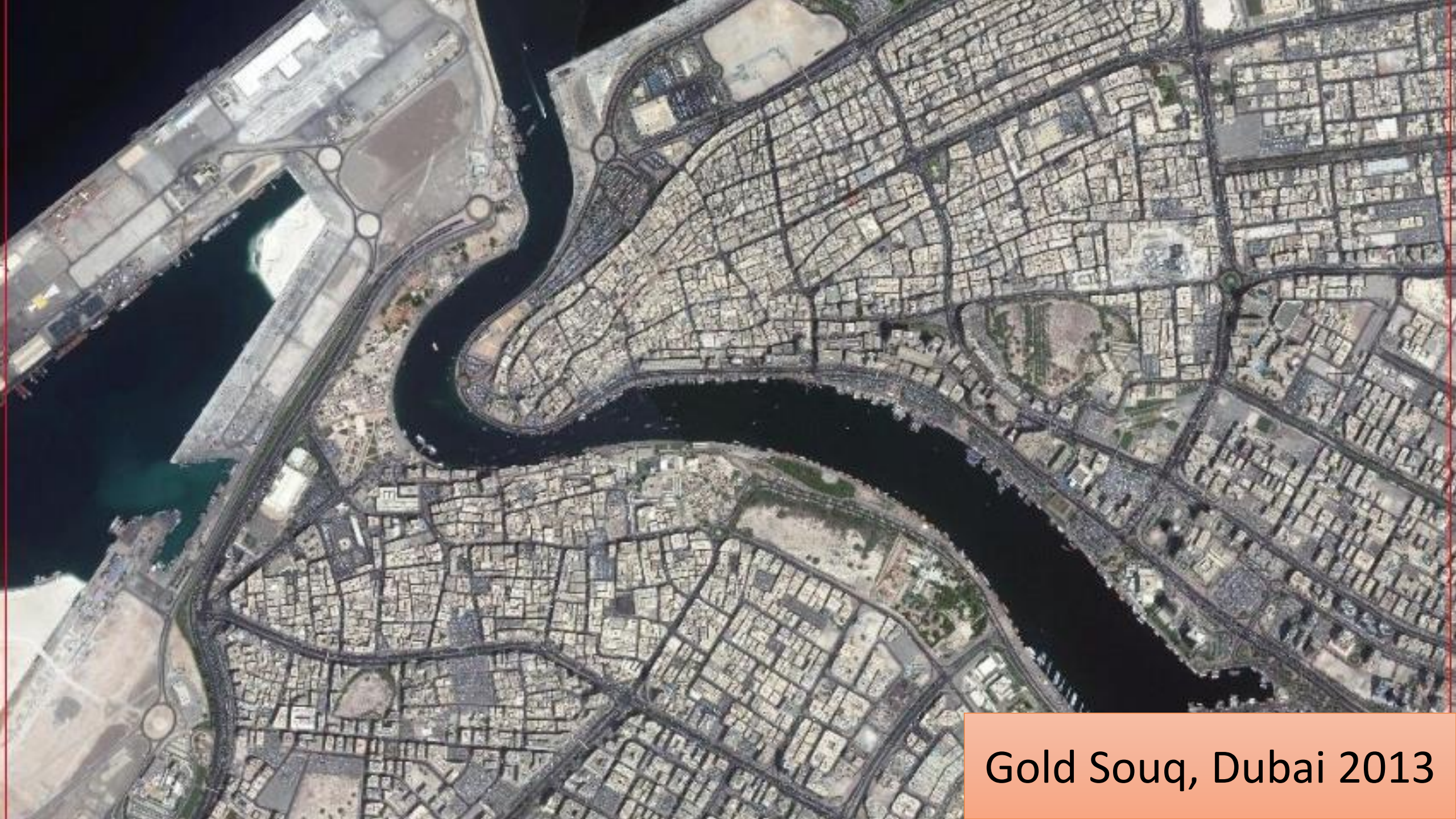
Gold Souq, Dubai 2013