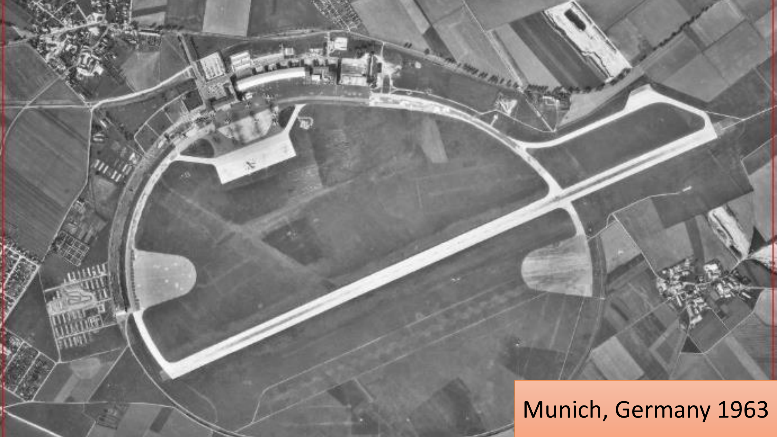
Munich, Germany 1963