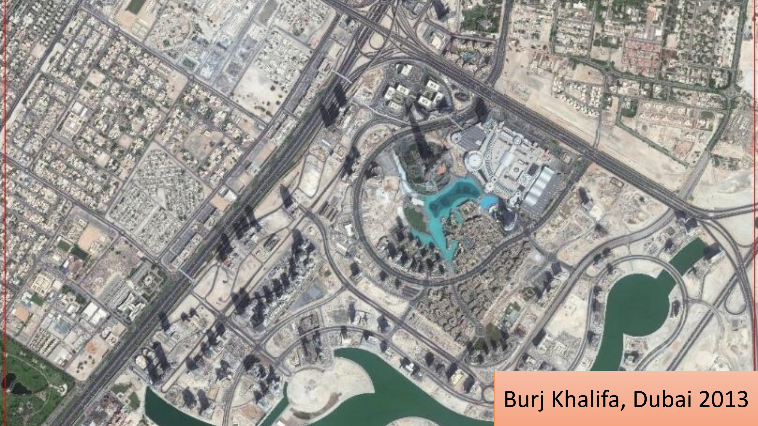
Burj Khalifa, Dubai 2013