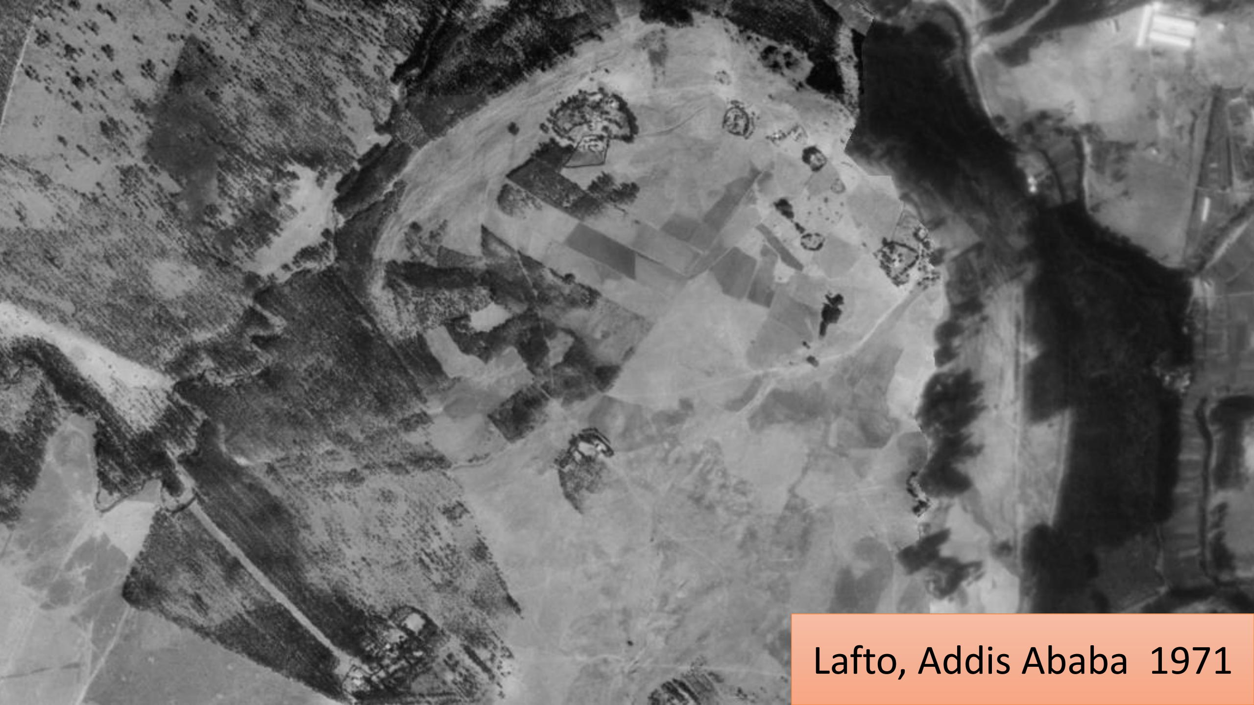
Lafto, Addis Ababa 1971