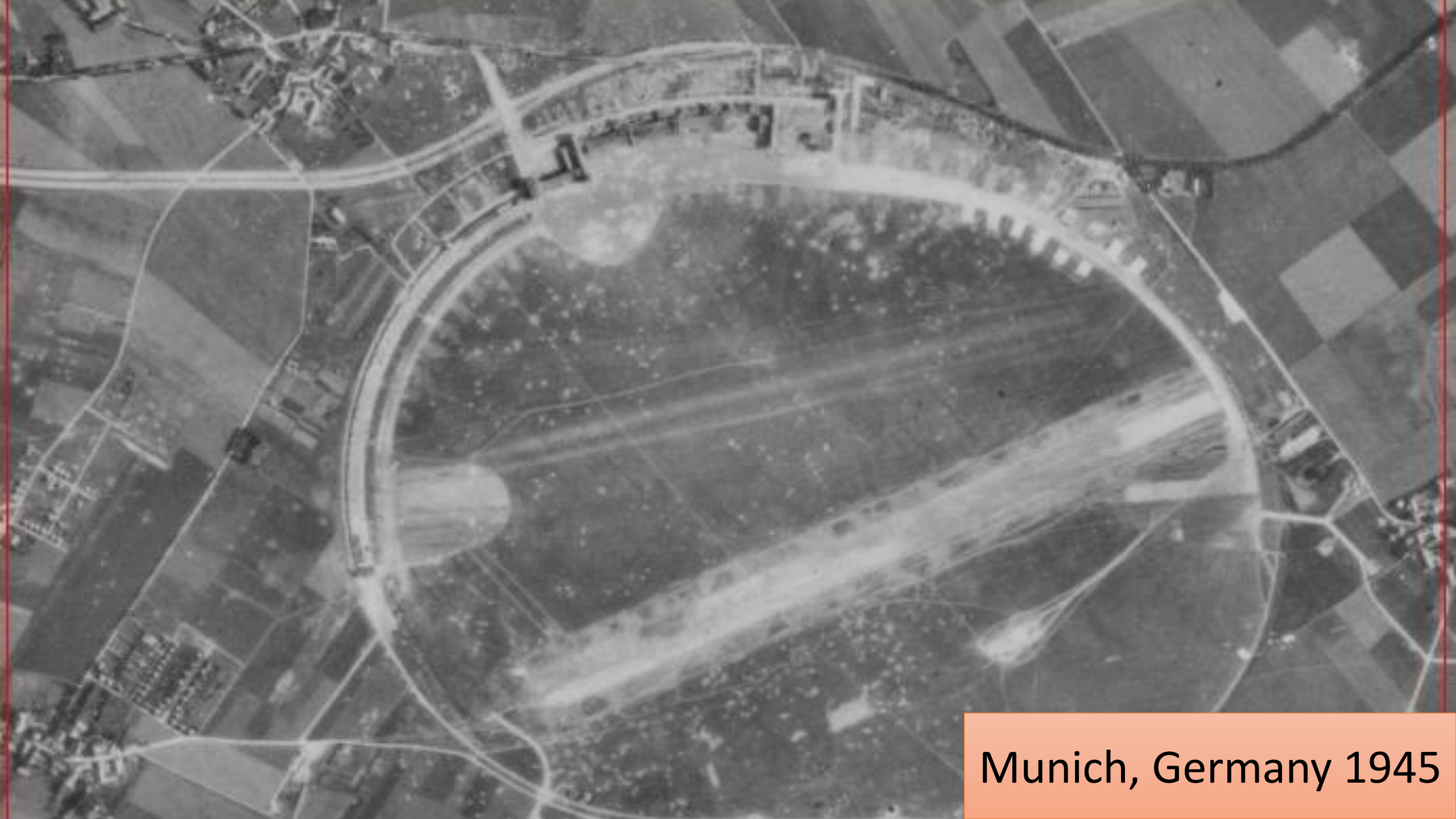
Munich, Germany 1945