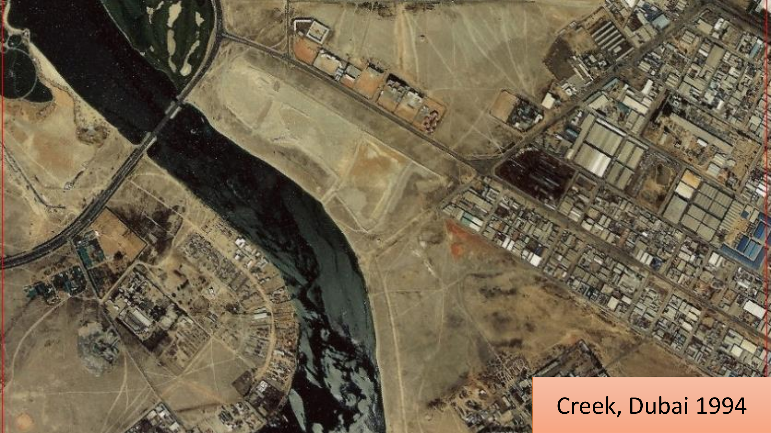
Creek, Dubai 1994