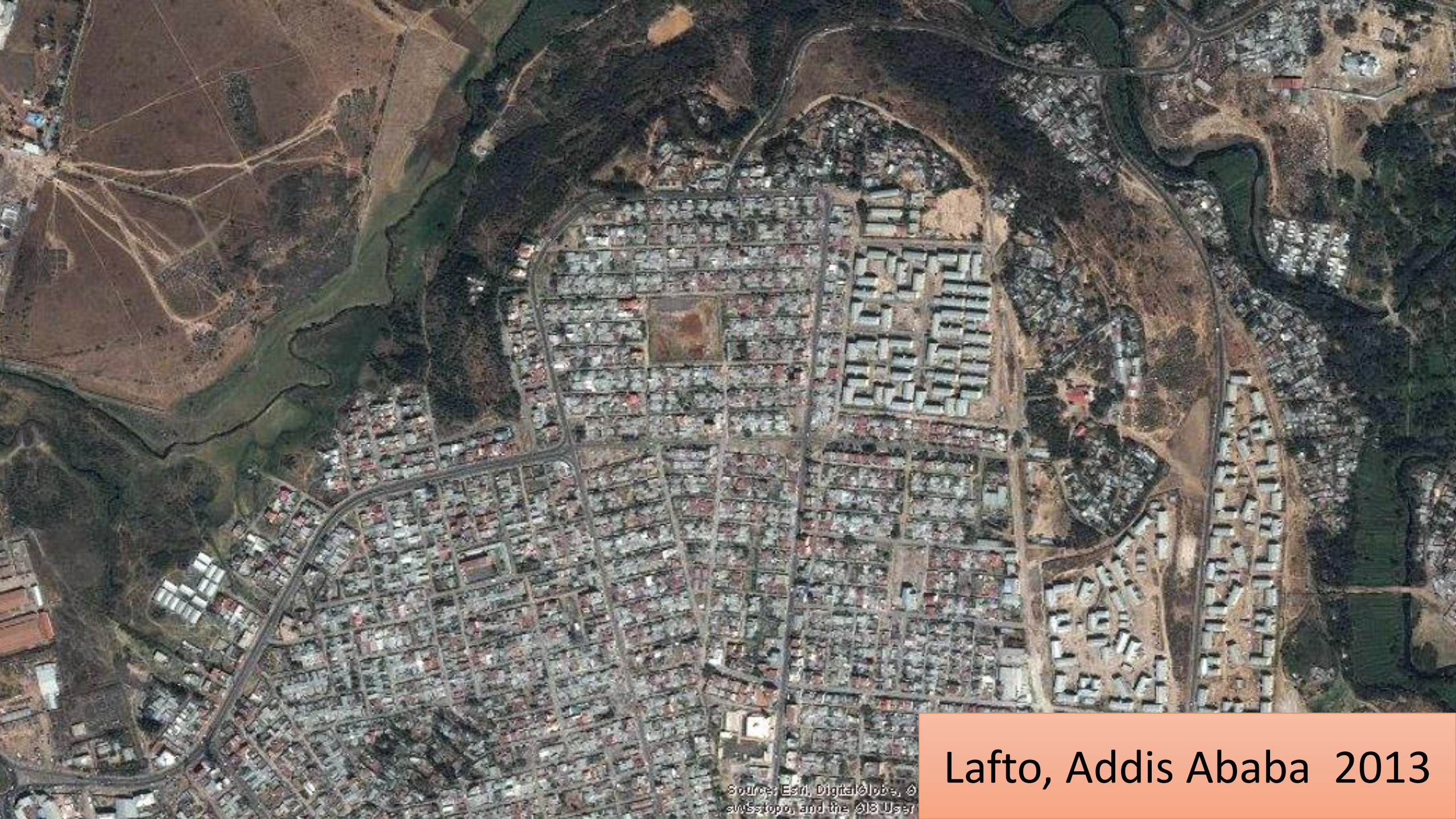
Lafto, Addis Ababa 2013